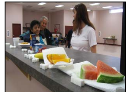
Portion-size displays used for teaching healthy eating