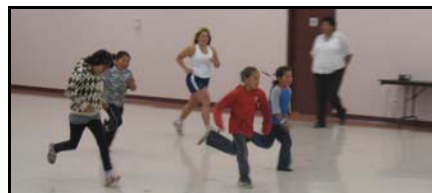
Shuttle Run Testing at the new Community Hall in Driftpile